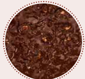
F329 CHOC FLAKES VARIEGATO Milk Chocolate paste with a mix of crunchy cereals. 2 x 3 kg