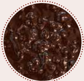
F335 CHOCO BISCUIT VARIEGATO Taste of chocolate and a cascade of biscuit chunks. 2 x 3 kg H K