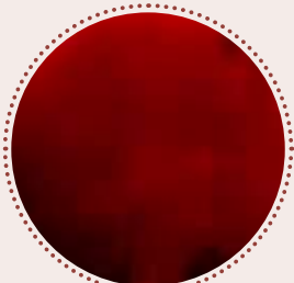
F015 CARAMEL SAUCE Caramel taste, ideal for Panna Cotta. 2 x 3 kg H K