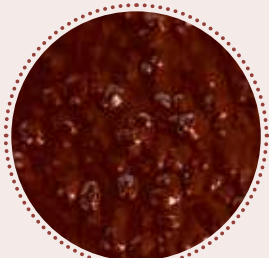
F118 BROWNIES VARIEGATO Fluid paste with dark chocolate flavor, with a cascade of small pieces of Brownies. 2 x 3 kg H K