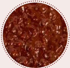
F337 CHOCO PEANUTS VARIEGATO Taste of cocoa and hazelnut, with caramelized peanuts. 2 x 3 kg H K