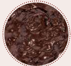
F348 CHOCOCHERRY RUM VARIEGATO Rhum chocolate taste with cherry pieces. 2 x 3 kg