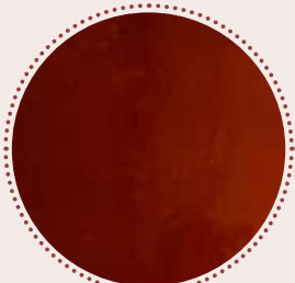
N678 BUTTERSCOTCH VARIEGATO Butterscotch taste, delicious caramel from British tradition. 2 x 3 kg H K