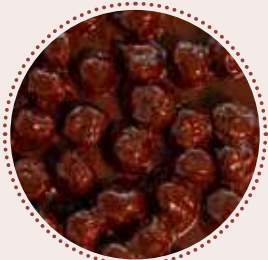
F308 CHOCO PUFF VARIEGATO Choco hazelnut taste with profiterols. 2 x 3 kg K